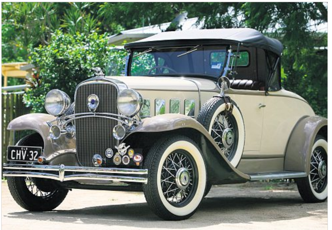
SENTIMENTAL VALUE: The Kavanaghs' beautifully restored 1932 Chevrolet BA Confederate Deluxe Roadster.