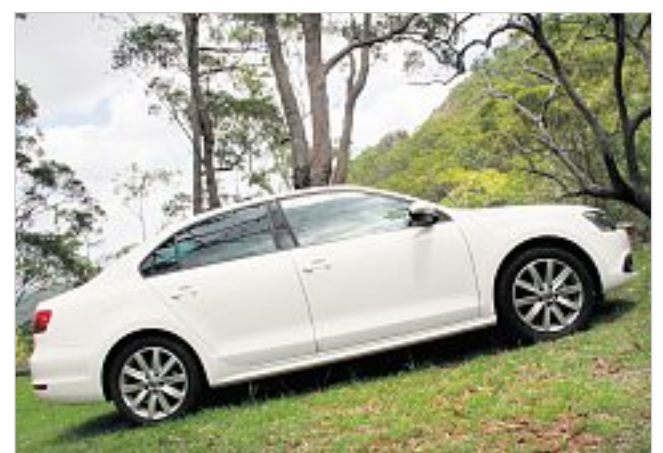
NEW AIR OF STYLE: Introducing the all-new Volkswagen Jetta, exclusive to Rockhampton Prestige. PHOTO: ROK22110TKJETTA2

It's the refined exterior that you'll notice first. The aerodynamic front end directs air around the car, aided by the sharp bonnet lines and carefully contoured roof and rear end.